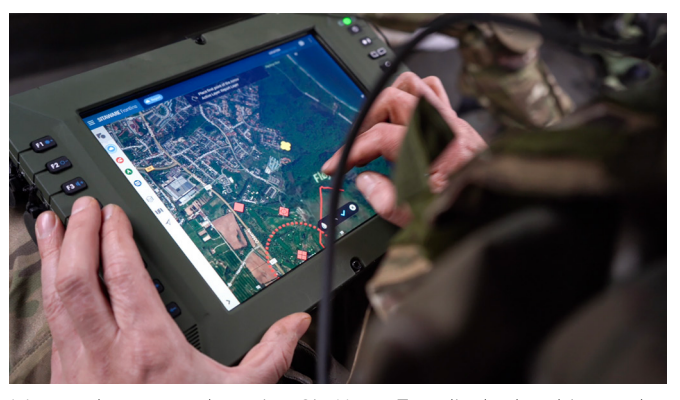
Mounted commander using SitaWare Frontline's sketching tools

Using the SitaWare Tactical Communication (STC) protocol, SitaWare Frontline enables clear communication and effortless data transmission in challenging conditions, improving the speed of manouvre for the mounted commander.